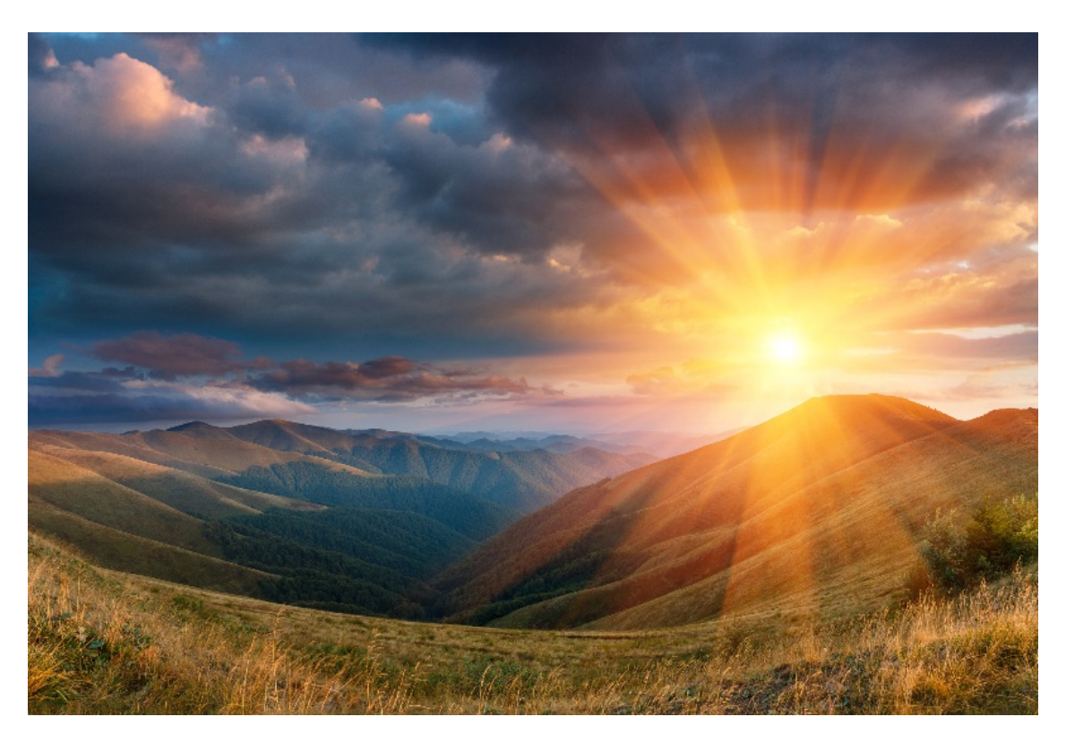
Putting Our Trust in God

"He put a new song in my mouth, a hymn of praise to our God. Many will see and fear the Lord and put their trust in him."