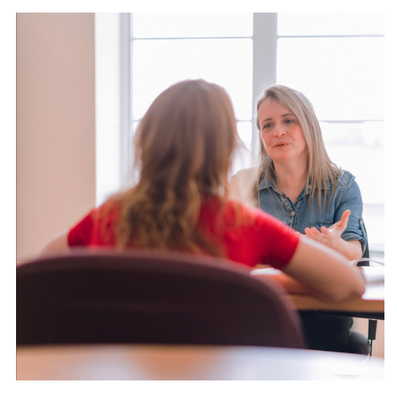
In November 2023, Pacific Union College and Loma Linda University formally agreed to establish a 4+1 Master of Social Work (MSW) program, streamlining the transition from a bachelor's degree to a master's degree for students. This innovative program simplifies the application process for students, requiring only one application and acceptance step. MORE