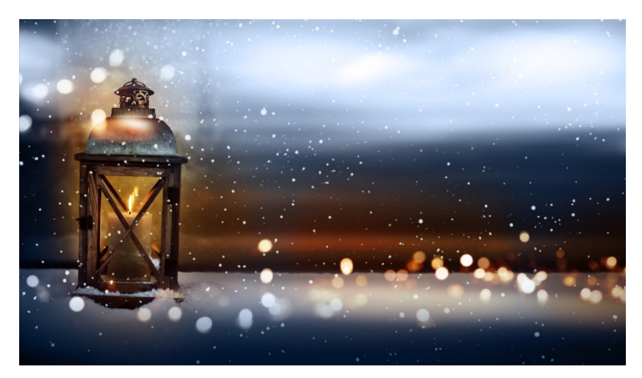
What We Have Experienced

"Our evangelism cannot just be about telling people what we know. It is about telling people what we have experienced. Tell me about how you went through loss. And you can still believe that God is good. Talk to me about that. ... Talk to me about your actual experience with Jesus."