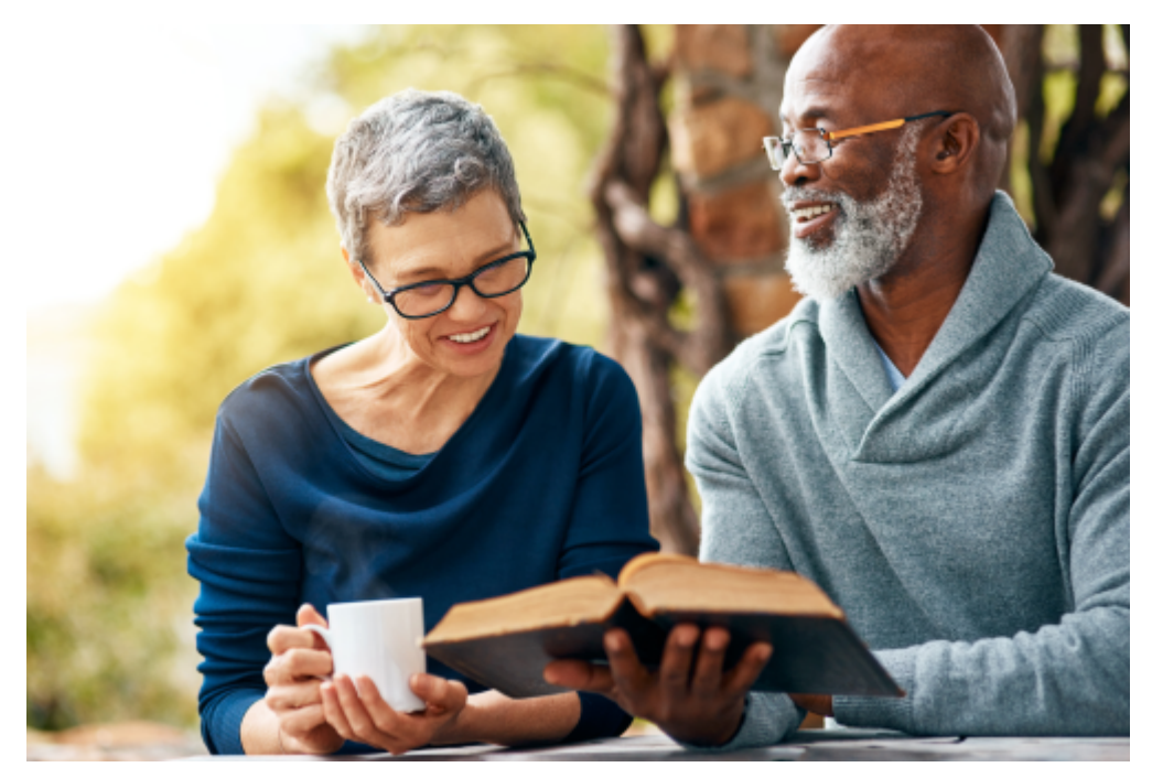
God's Holy Principles

"Let us make God's holy word our study, bringing its holy principles into our lives."