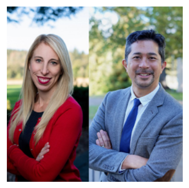
Pacific Union College is embarking on a new three-school model for the upcoming year and announced on April 4, the appointments of the three deans who will help lead the efforts to maintain and grow the college's academic excellence. MORE

Opportunities for Hispanic Americans Program (PPOHA) Title V Part B grant. Over the next five years, SWAU will receive more than $2.7 million to develop a Master of Science in Nursing Education program with state-of-the-art wrap-around student success services. MORE