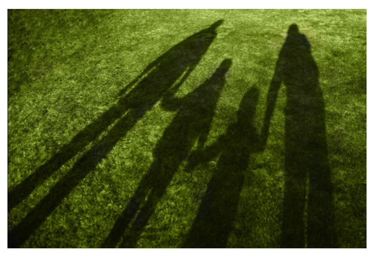
Love Is ...

"Love is not a strong, fiery, impetuous passion. On the contrary, it is calm and deep in its nature. It looks beyond mere externals, and is attracted by qualities alone. It is wise and discriminating, and its devotion is real and abiding."