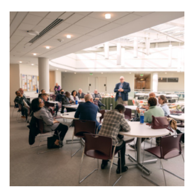
November 16, 2022

Over the course of the 2022 Year-End Meeting of the North American Division, the executive committee comprised of church leaders participated in three breakout sessions on specific topics. They were divided into groups based on unions and tasked with responding to a few provided questions, then bringing back a summary of their main points to the group at large. MORE