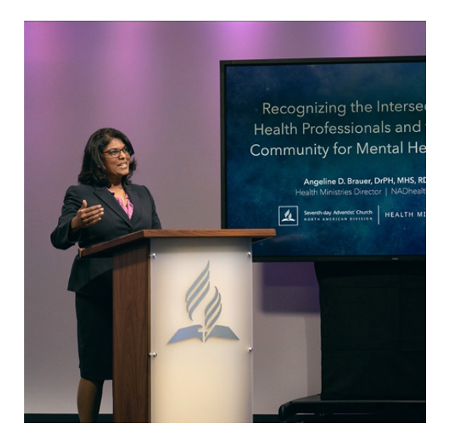
April 6, 2022

The 2022 NAD Virtual Mental Health Summit took place March 31-April 3. In order to attend the entire event, many participants registered on Zoom; the daily average viewers reached for general session plenaries on Facebook on Thursday and Friday was close to 2,000. <u>MORE</u>