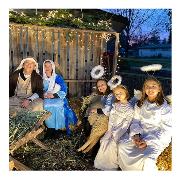
For the second year in a row, the Orangevale Seventh-day Adventist Church hosted a drive-

thru Christmas event for its community. On Dec. 11, the California church welcomed more than 350 people who came to view a manger scene with live animals, hear voice and bell choirs, enjoy refreshments, and receive gifts. They also had the opportunity to participate in a canned food drive. MORE