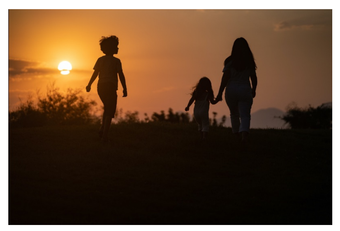
Present With You

"Imagine Him present with you. Live in contact with the living Christ and He will hold you firmly by a hand that will never let go. Know and believe the love that God has ... and you are secure. That love is a fortress impregnable."