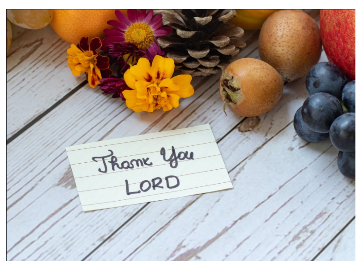
In Praise and Thanksgiving

"I will praise the Lord all my life; I will sing praise to my God as long as I live. He is the Maker of heaven and earth, the sea, and everything in them — he remains faithful forever. He upholds the cause of the oppressed and gives food to the hungry. The Lord sets prisoners free, the Lord gives sight to the blind, the Lord lifts up those who are bowed down, the Lord loves the righteous. The Lord watches over the foreigner