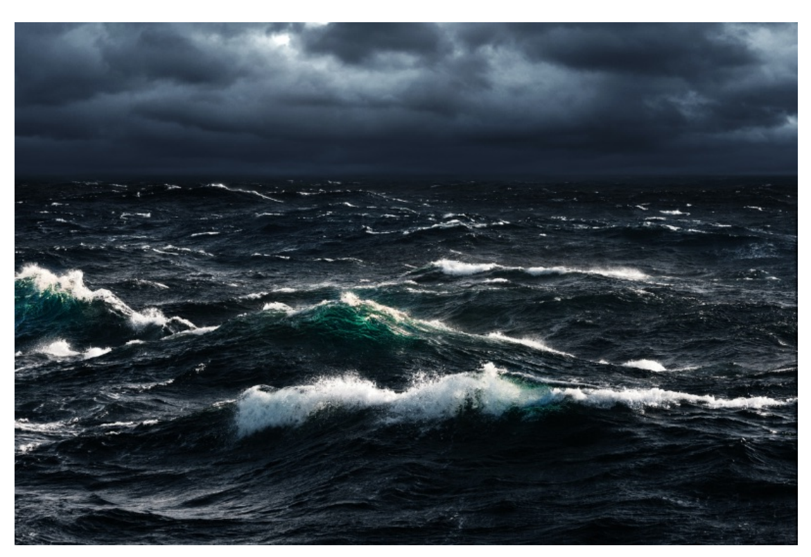
God's Got You