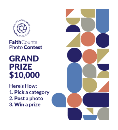
Photo Your Faith contest! The theme is "Finding God in the World." Participants can submit their photos to four categories: nature, sacred spaces, home, and faith in action, for a chance to win a $10,000 grand prize. Pull out your camera and share how you find God in the world in the Photo Your Faith contest — just be sure to submit your photos by Oct. 11, 2021. Go to faithcounts.com for details.