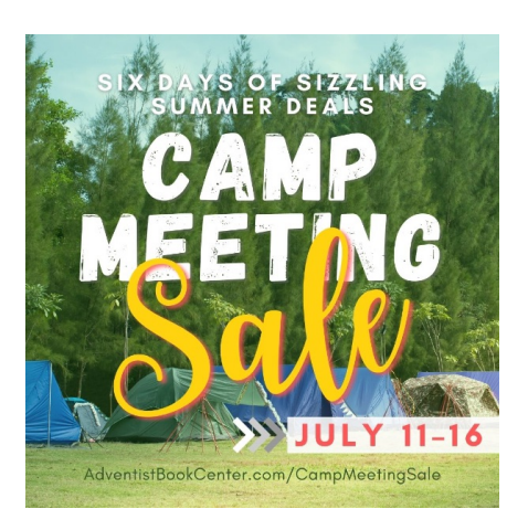
Snapping up new and best-selling books at deep discounts during camp meeting "auditorium sales" is a much-anticipated Adventist tradition. In