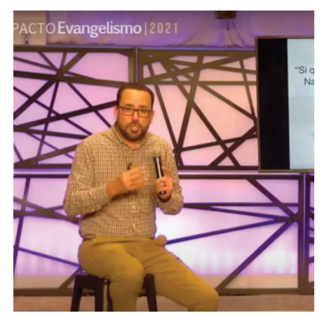
Merely 12 months ago, the Carolina Conference Ministerial Department had hosted more than