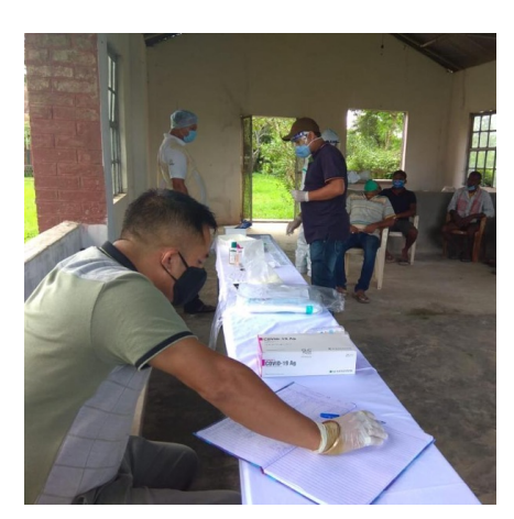
ADRA is preparing to airlift critical medical supplies and several oxygen generation systems to ease India's coronavirus health crisis. The humanitarian agency is partnering with the

vaccines. Healthcare professionals, communication experts, and church theologians will talk about the Bible and science, and help make sure members are well informed when deciding whether to take the vaccine. MORE