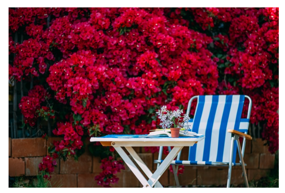
Find Rest of Spirit

"Find rest of spirit in the beauty and quietude and peace of nature."