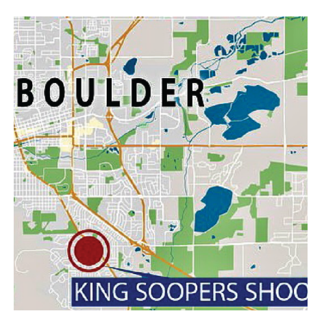
"The Rocky Mountain Conference is mourning with the community of Boulder after a senseless act of violence claimed the lives of ten individuals, including a law enforcement

evangelism visioning and leadership team, was held virtually on March 8-9. The NAD Ministerial Association event was broadcasted live from the division's headquarters in Columbia, Md. <u>MORE</u>