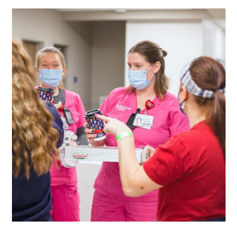
It started with gratitude: A simple idea to acknowledge/appreciate the dedication of healthcare

If the Equality Act becomes law, what would the implications be for the Adventist Church? What are the optics of opposing this landmark legislation that would expand protections found in the Civil Rights Acts of 1964 to include matters of gender identity and sexual orientation? <u>WATCH/LISTEN</u> to the latest NewsPoints ON THE AIR podcast on our Facebook page.