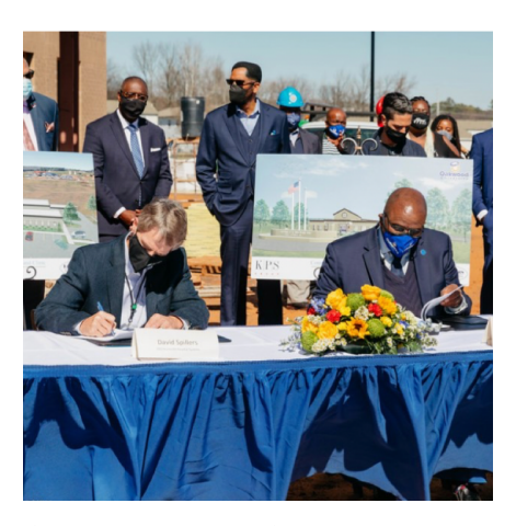
On Feb. 24, 2021, Oakwood University and Huntsville Hospital hosted a lease signing event at the Oakwood University Community Health Action Center construction site at