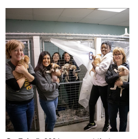
On Feb. 5, 2021, an event that started from a Southwestern Adventist University student's passion to serve, took place for the 4th consecutive year with more 200 students supporting dozens of organizations across two Texas counties. MORE