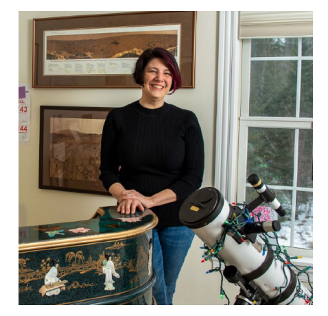
Like many, NASA scientist R.

Widespread testing has long been touted by public health officials as one of the best ways to control the COVID-19 pandemic and save lives. In January, in keeping with this guidance, La Sierra University bolstered its disease detection efforts with the rollout of new, rapid-test equipment. On Jan. 13, 2021, the university's student wellness services department deployed a rapid point-of-care PCR Cepheid GeneExpert Express molecular testing system. <u>MORE</u>