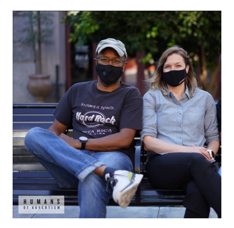
Humans of Adventism launched in