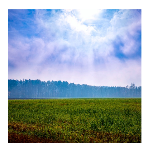
March 10, 2021