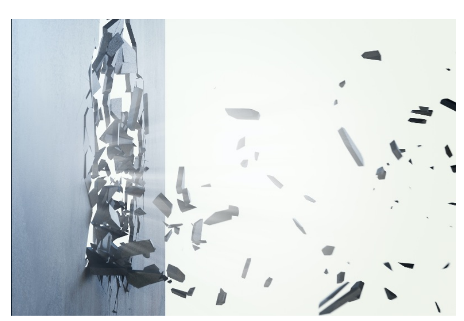
Take Down the Walls that Divide Us

"This is our history: to correct the false narrative of God that has been preached to oppressed people, to correct this and to validate their worth to Him. He died and gave His life for all people. He [died] to take down the systemic and perpetual walls that divide us."