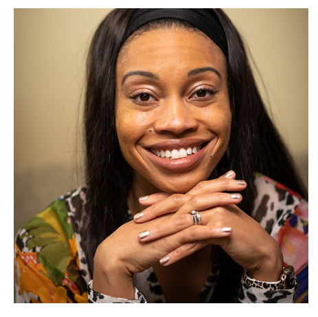
With a mother who is a professional radio personality and a father who is a disc jockey,

Breath of Live Television Ministry conducted a "water drive," collecting more than 30,000 bottles of water as well as other essential items. The items traveled by truck on Feb. 22 from Huntsville, Alabama, to the Houston, Texas area for distribution the next day. MORE