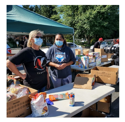
Bright and early every Tuesday

Museum and Research Center's 25th annual summer dig in Wyoming. Through the past quarter century, this special project has excavated and cataloged more than 30,000 dinosaur bones. As the research project has gained world-wide recognition over the years, the number of summer participants has outgrown the capacity of the onsite research station, which lost its roof in a recent storm. MORE