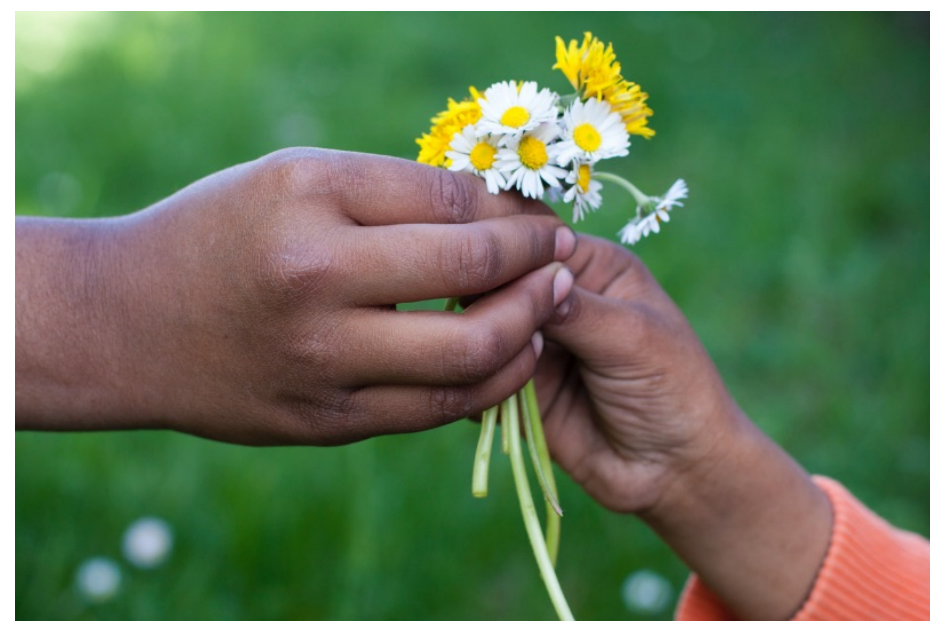
Bring an Example of Love

"Let's remember, on this Thanksgiving Day, to be thankful for each other and not focus on faults that others have. Let's try to live in unity and bring an example of what it means to love our neighbor to our country, because it's in dire need of experiencing the love for each other as we know today."