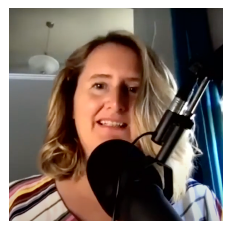
November 18, 2020

The 2020 enditnow Summit on Abuse took place virtually Nov. 13-14, streaming on the enditnow website and on Facebook. The annual