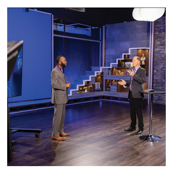
October 7, 2020