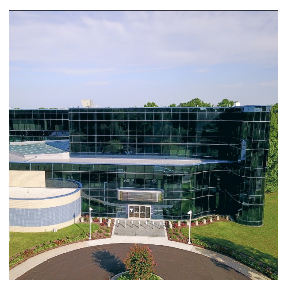
En preparación para su reunión de fin de año, la División Norteamericana explica el proceso virtual, medidas de seguridad para el personal presencial. Haga clic aquí para leer en español.