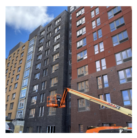
New York has issued a temporary certificate of occupancy for the newly-completed Northeastern

Towers Annex. The administration of the Northeastern Conference of Seventh-day Adventists conceived the project due to a growing backlog of applications in the original Northeastern Towers building. On Oct. 7, conference administrators were