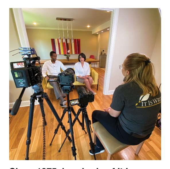
Since 1975, hundreds of It Is Written ministry partners have gathered with the It Is Written ministry leadership team at weekend partnership events. Owing to the COVID19 pandemic, It Is Written will be conducting most of its 2020 Partnership events virtually for the first time. MORE