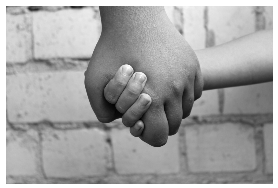
Do What Is Right and Just

"This is what the Lord says: Do what is just and right. Rescue from the hand of the oppressor the one who has been robbed. Do no wrong or violence to the foreigner, the fatherless or the widow, and do not shed innocent blood in this place."