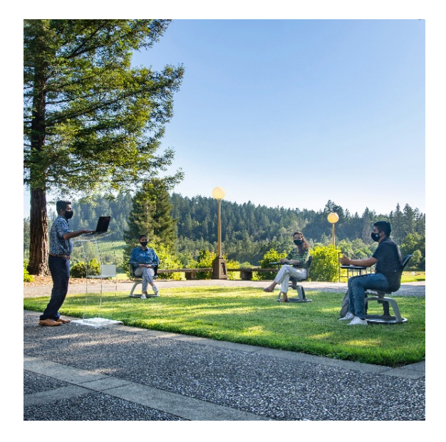
July 29, 2020

Adventist institutions of higher education in the NAD have made extensive preparation for the campus life and learning environments of their students by prioritizing safety and wellness. The colleges and universities have maintained a commitment to their missions of providing wholistic education while adapting to their respective local government mandates related to preventing the spread of COVID-19. LEARN MORE