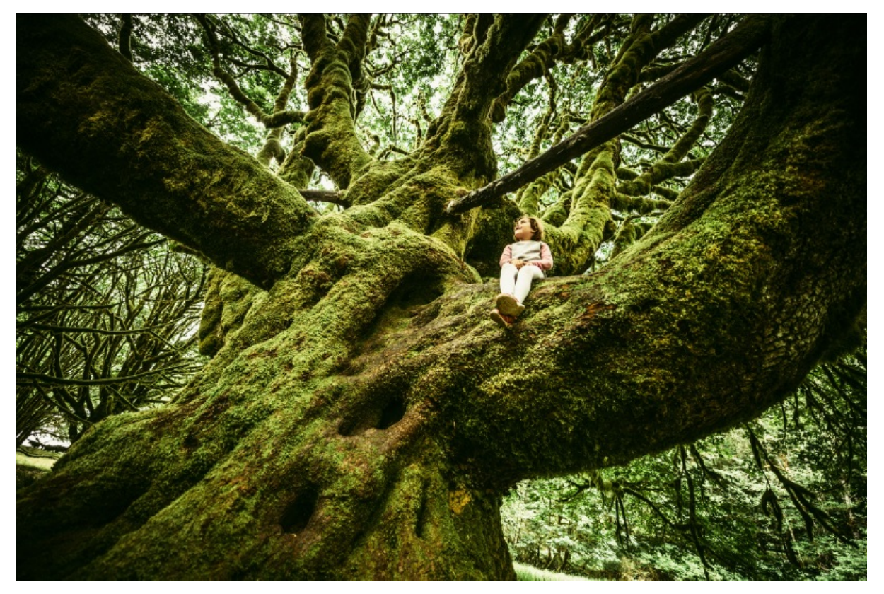
Plant the Seeds

"Are we too busy peddling platitudes, prophetic prose, and prohibitive policies to plant the products that we preach? God forbid! May it never be so! Saving grace, born of salvation, and fearless pursuit of the mission of Christ. ... These are the seeds that God has given us. ... These seeds are gifts of God, crafted by the Holy Spirit, uniquely for you and for me. When 'dream seeds' are planted, fertilized, and grow, the fruit of the spirt, mentioned in Galatians 5:22-23, becomes evident. Don't just peddle the seeds of your ministry. Plant them, cultivate them, climb upon the branches, and prepare to reap your harvest."