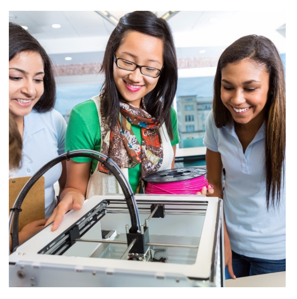
On March 6, Versacare Foundation awarded $1,420,000 in grant funding to 189 Adventist primary

While society at large has taken a metaphorical detour in terms of its normal operation with the closing of businesses and schools, the needs of the marginalized remain. Here are glimpses into three services operating within the NAD that have remained committed to serving their disenfranchised populations as they face daily evolving challenges and the potential dangers presented by the coronavirus disease. MORE