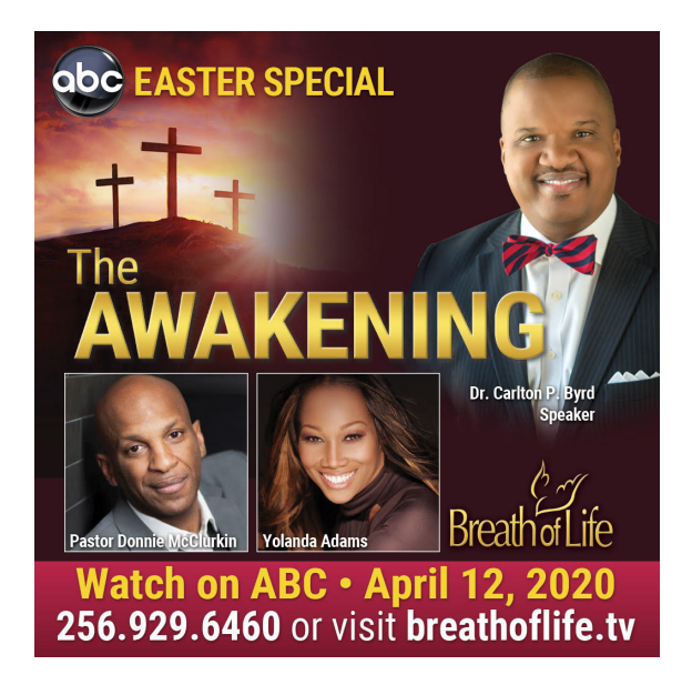
April 8, 2020

Breath of Life Television Ministries is bringing the message of Christ's resurrection to living rooms across the country this Sunday, April 12, 2020, as ABC affiliates will broadcast, "The Awakening." <u>MORE</u>