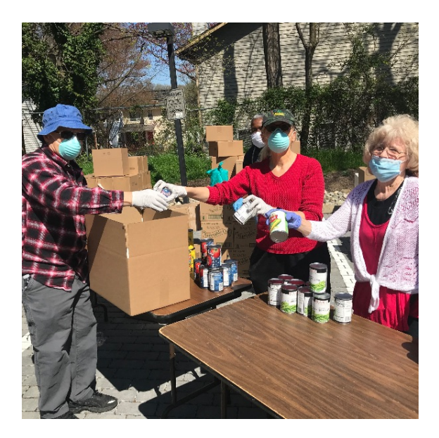
April 1, 2020

Serving the homeless, sick, and food insecure in the face of the COVID-19 pandemic — ministry leaders employ faith and adaptability to continue serving their communities during a time of unprecedented restrictions on mobility and gatherings. Read about three special outreach programs as they attempt to serve during this health crisis. MORE