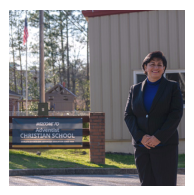
March 5, 2020

After accruing debt during more than one year, the board an Adventist school in Augusta, Georgia, decided to give tithes on all the school's fundraisers for the 2016-2017 year. The school finished the year with $68,000 in the bank. <u>MORE</u>