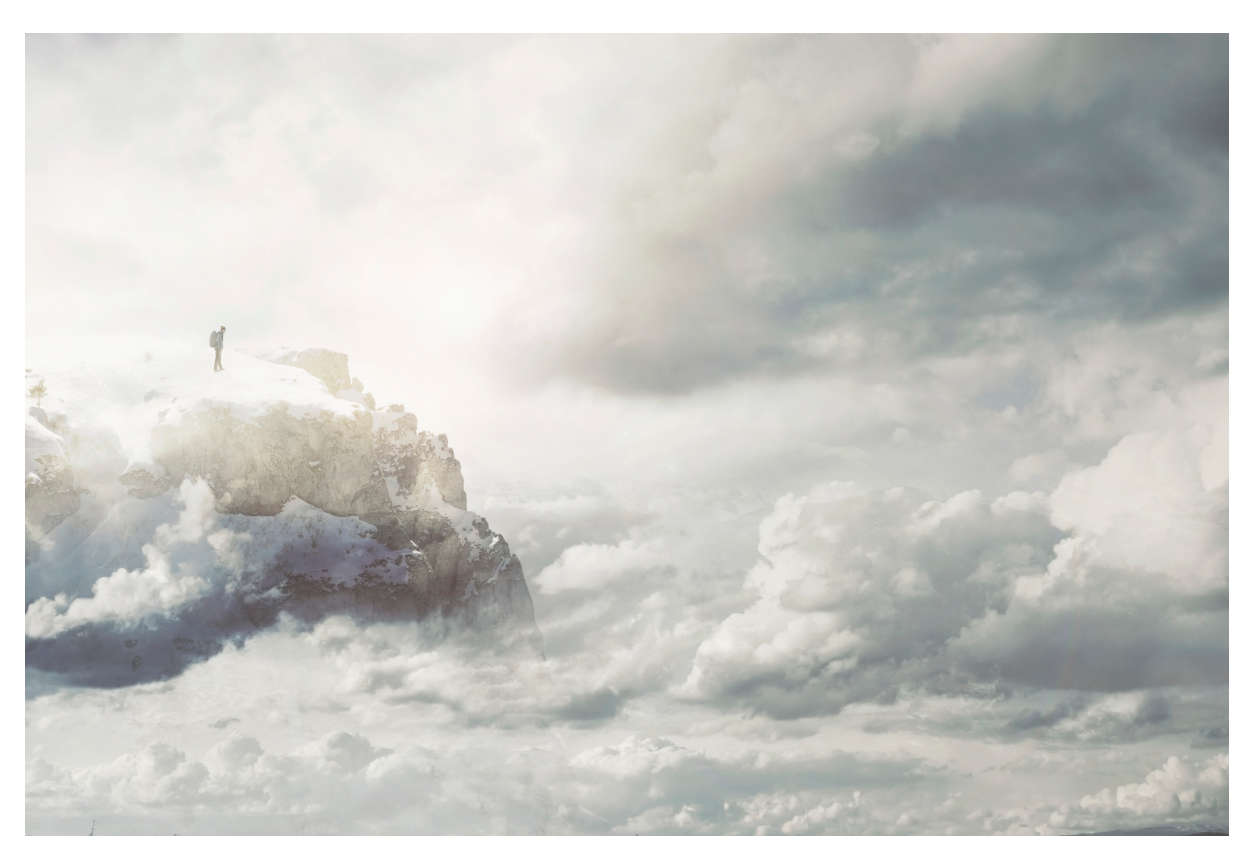
I Put My Trust in You

"Hear me, Lord, and answer me, for I am poor and needy. Guard my life, for I am faithful to you; save your servant who trusts in you. You are my God; have mercy on me, Lord, for I call to you all day long. Bring joy to your servant, Lord, for I put my trust in you."