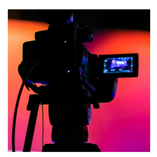
"We don't think online church should be our best attempt at

Due to the rapidly-changing situation with the coronavirus disease pandemic, the NAD administration has elected to transition its corporate office in Columbia, Md., to a virtual operation. Starting at the end of business on March 17, 2020, and moving forward until March 30, all employees will be required to work from home. READ this statement in its entirety, as well as other messages stemming from the division's COVID-19 response.