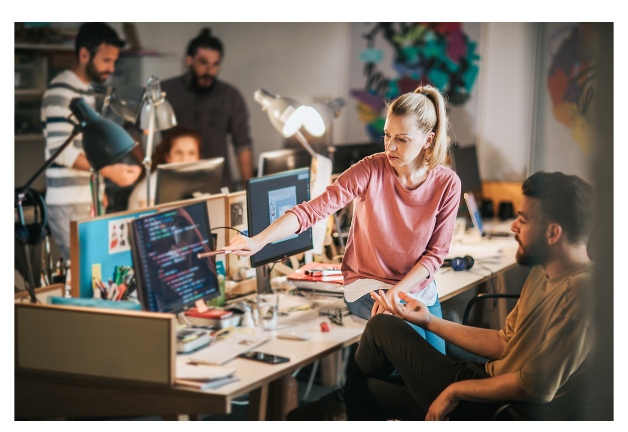
Satisfaction in Toil

"This is what I have observed to be good: that it is appropriate for a person to eat, to