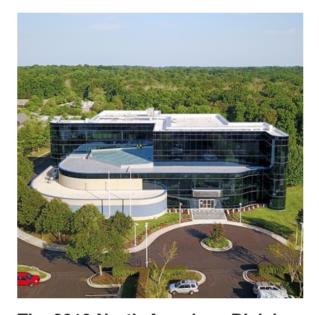
The 2019 North American Division Year-End Meeting starts this week, on Oct. 31, and goes through Nov. 5. Watch the morning worships, business sessions, Friday evening program, and Sabbath morning church service from the YEM by clicking here, or on Facebook or YouTube. You can also follow the discussion on Twitter, using #NADYEM19.