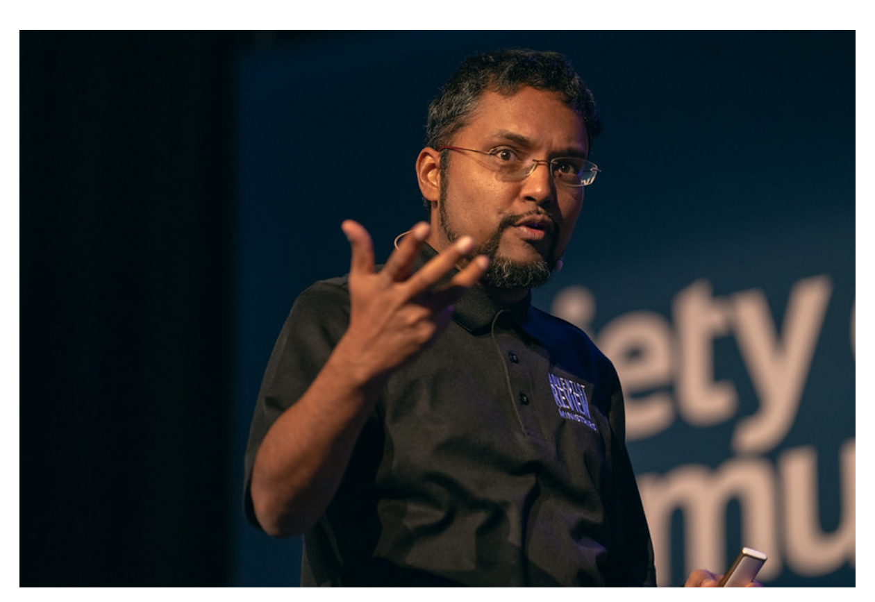
Curtain Maker, Or Light Control Company?