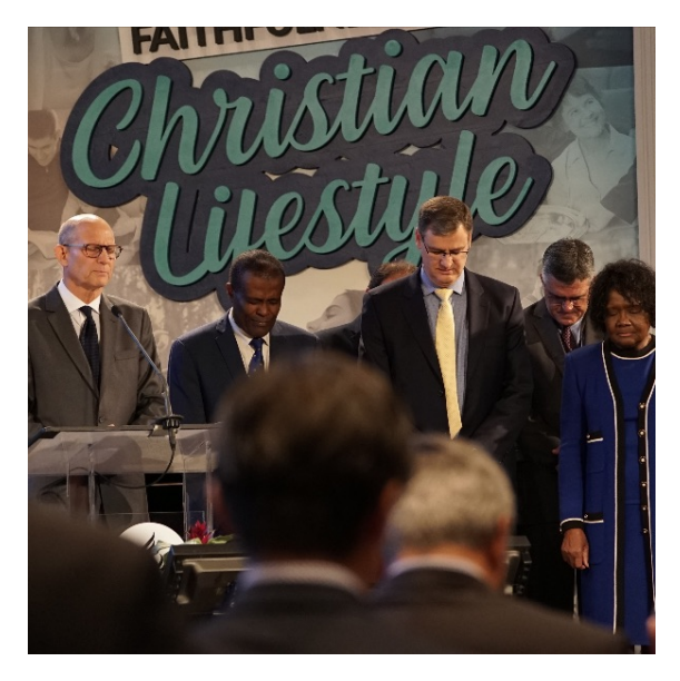
On Oct. 14, the Seventh-day Adventist Church and ADRA, its international humanitarian agency, announced a new global campaign, "Every Child. Everywhere. In School." One million signatures are needed. MORE