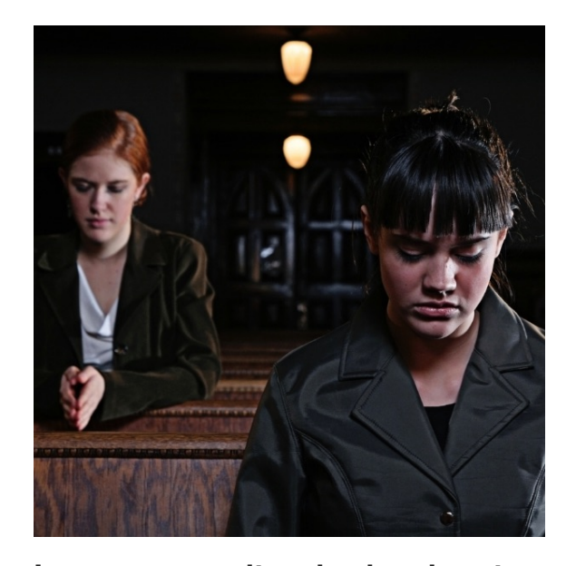
In every pew sits a broken heart. Even those who look good and smell good. Even those who answer all the questions correctly and can sing the morning hymn without even looking at the hymnal. The enemy is clever and tenacious. And all of us come to worship fresh from the battlefield. MORE