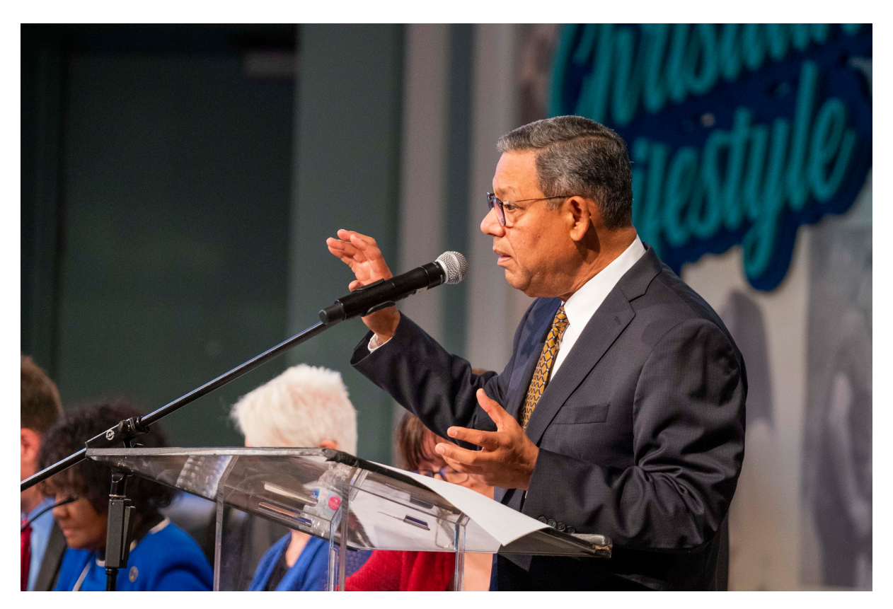
Trust Is All We Have

"Trust is all we have. The most powerful transaction is when a person ... goes to church, takes that tithe envelope, and puts it in the hands of the church. It takes an enormous amount of trust to do that. I call on all [leaders], do not betray that trust."