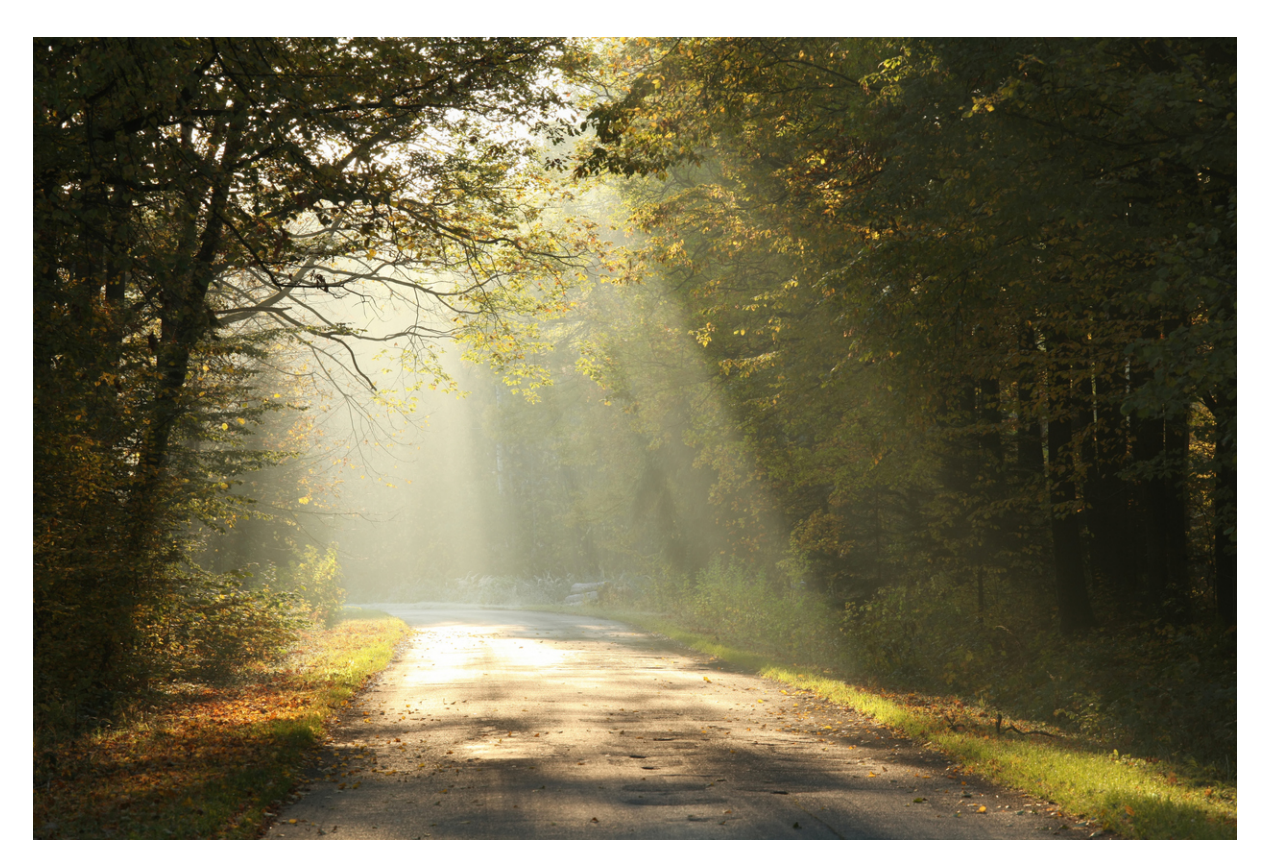
God Goes With You

"Be strong and courageous. Do not be afraid or terrified because of them, for the Lord your God goes with you; he will never leave you nor forsake you."