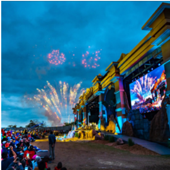
Photo essay: Check out photo highlights from the 2019 Chosen International Pathfinder Camporee before fields of the EAA again became quiet and empty after 55,000 moved in for almost one week. In this photo essay are small glimpses into the massive, bustling event, where Jesus took center stage, along with His “chosen” youth. MORE