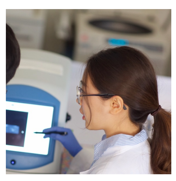
On May 23, the La Sierra University Office of Advancement

Seventh-day Adventist Church leaders from around the world witnessed mission in the North American Division context when they visited several locations in the division during the 2019 NAD Experience held June 26 to July 7. NAD leaders shared a glimpse of the territory's mission activity and ethnic diversity through touring four of nine union conferences. MORE