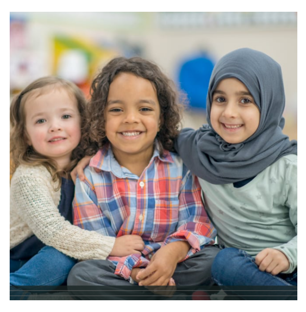
The Seventh-day Adventist Church in North America

What if I told you that spending a full five or six days in an open field, surrounded by 50,000 people or more, walking five to 10 miles per day, having to go to porta potties and bathe in shower houses, and sleeping in a tent and trying to keep up with a group of teens and preteens would be the best experience that you could ever have this summer? This is what happens every five years at the EAA airfields in OshKosh, Wis. MORE