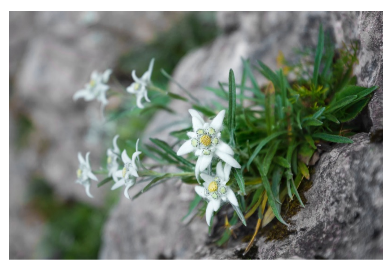
Achieving the Purpose

"As the rain and the snow come down from heaven, and do not return to it without watering the earth and making it bud and flourish, so that it yields seed for the sower and bread for the eater, so is my word that goes out from my mouth: It will not return to me empty, but will accomplish what I desire and achieve the purpose for which I sent it."