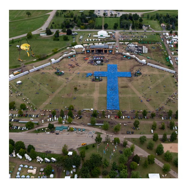
Two attempts at world records at