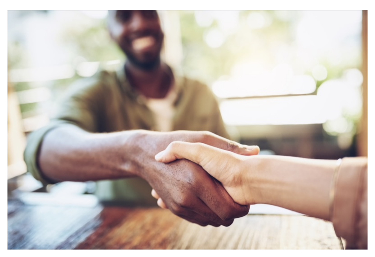
Kind, Courteous Christian

"A kind, courteous Christian is the most powerful argument that can be produced in favor of Christianity."