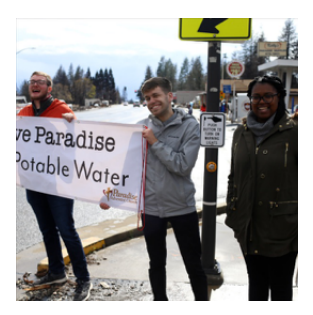
During spring break 2019, a group of students, faculty, staff, and alumni from Walla Walla University, Pacific Union College, Milo Adventist Academy, and Gracepoint Adventist Academy traveled to Paradise, California, to bring relief in ways that were most pressing in the community. MORE