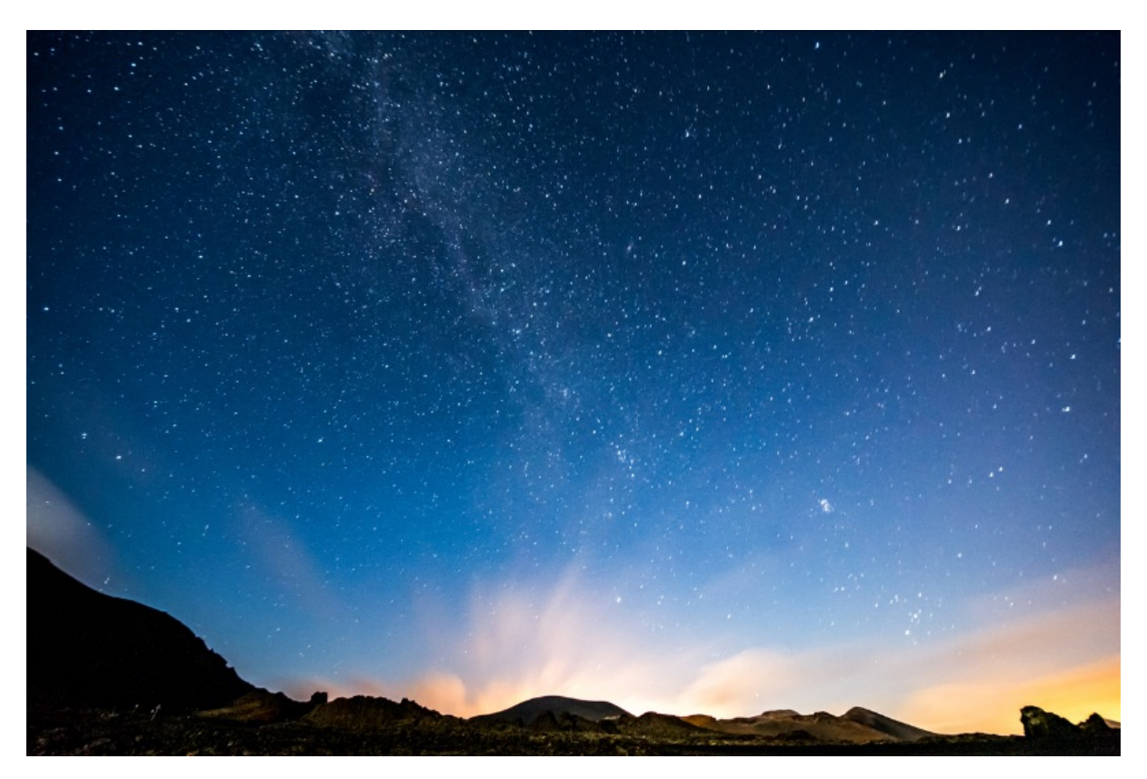
Stars of Heaven

"The stars of heaven are under God's control. He fills them with light. He guides and directs their movements. If He did not, they would become fallen stars. So with His ministers. They are but instruments in His hands, and all the good they accomplish is done through His power."