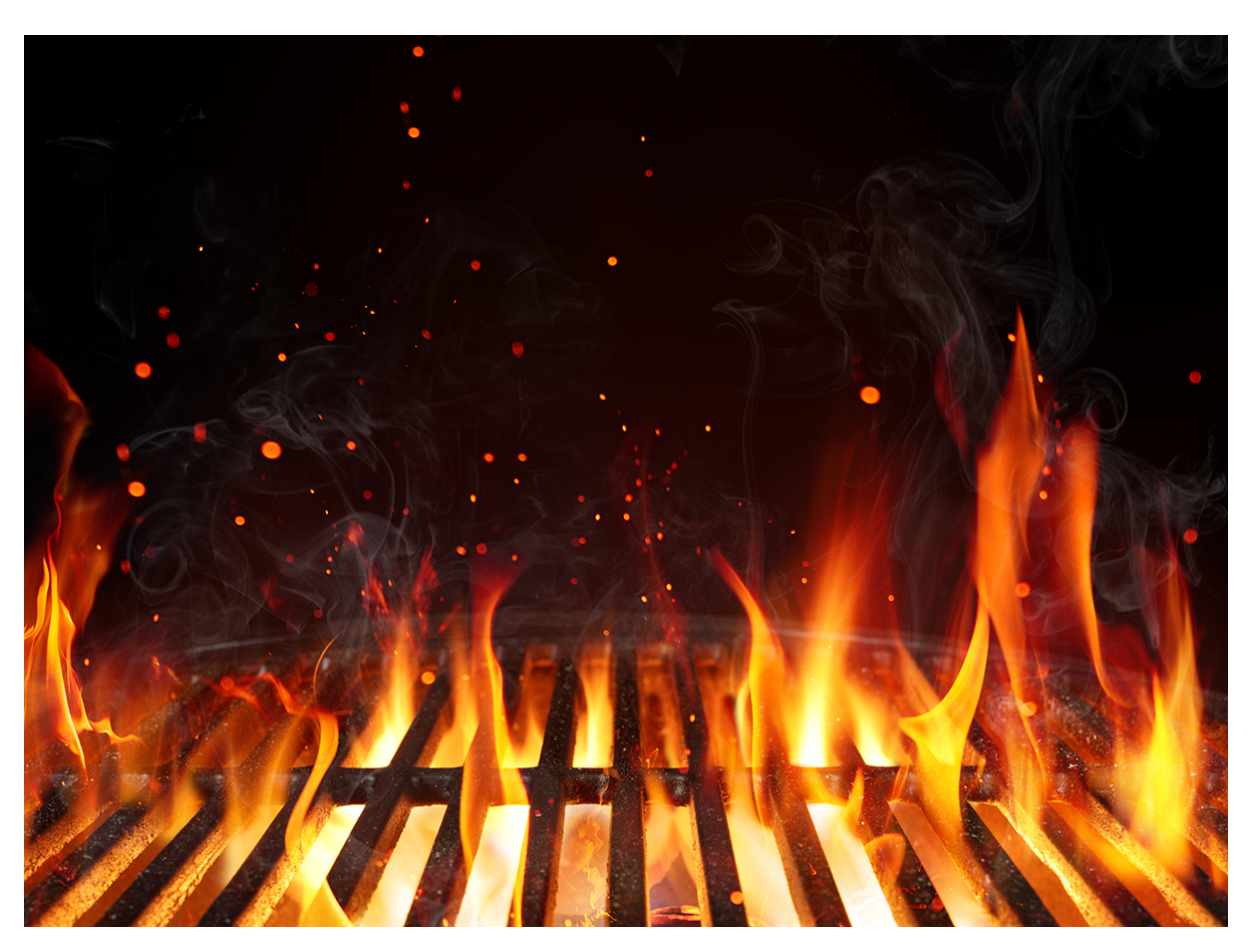
Through the Fire