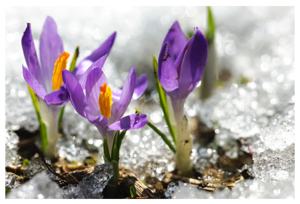
The Christian's Summer

"This earth is the place of preparation for heaven. The time spent here is the Christian's winter. Here the chilly winds of affliction blow upon us, and the waves of trouble roll against us. But in the near future, when Christ comes, sorrow and sighing will be forever ended. Then will be the Christian's summer."