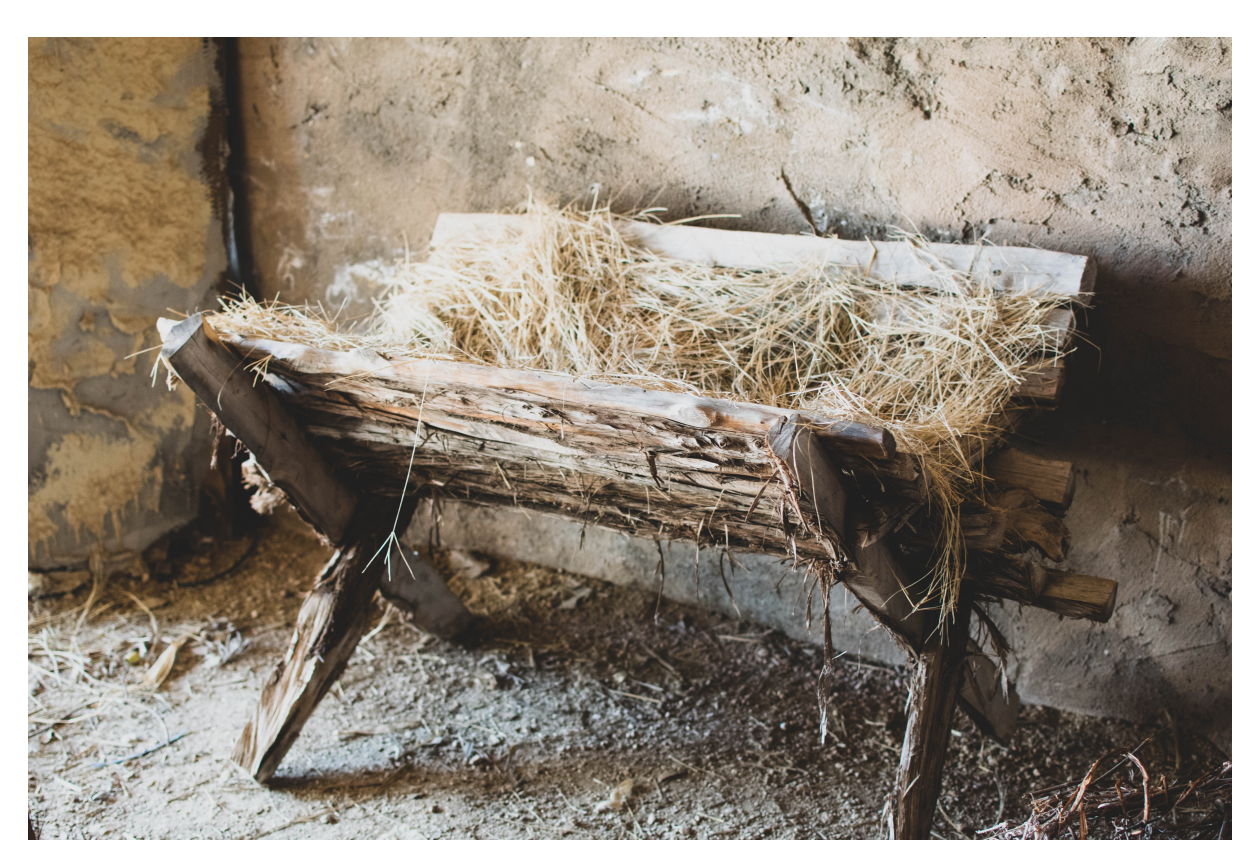
What a Gift

"But when the fullness of the time had come, God sent forth His son, born of a woman, born under the law, to redeem those who were under the law, that we might receive the adoption as sons' [Galatians 4:4-5].