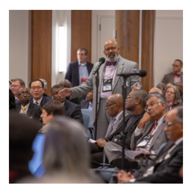
On Nov. 4, the morning business session of the NAD Year-End Meeting was devoted to a discussion on the voted General Conference document titled "Regard for

constituted the morning and afternoon business sessions of the North American Division Year-End Meetings held Nov. 1-6. Each morning featured a devotional speaker prior to status reports from NAD ministries and partners. <u>READ NOV. 2</u> and <u>NOV. 4</u> summaries.