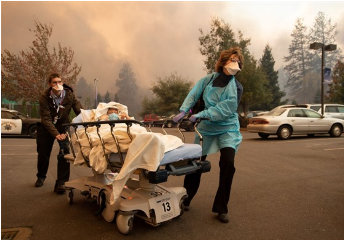
Photo: Adventist Health Feather River staff evacuates patients as the Camp Fire in Paradise, Calif., drew near the hospital, which miraculously survived the fire.