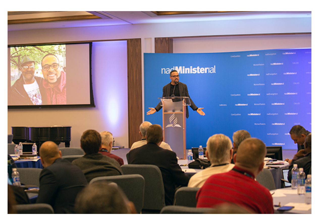
A Reputation for Restoration

"Wouldn't it be awesome when a Seventh-day Adventist Church is being planted in a community that the reputation of restoration of the Adventist church is so strong that