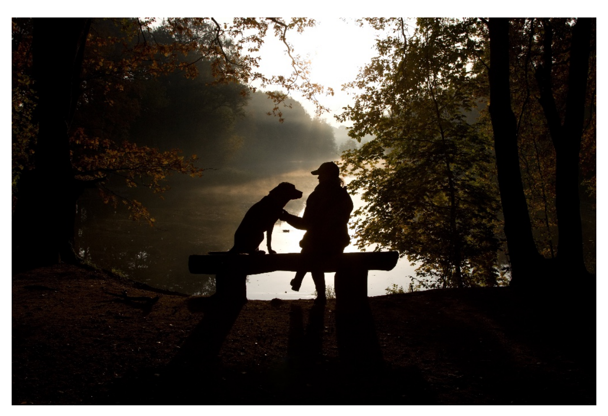
Great Is Thy Faithfulness

"When bad stuff happens, it's OK to be ticked off at God. If the poet of Lamentations [3] can give these word pictures, it gives us permission, and it's normal and it's natural to be angry with God. ... God is compassionate and faithful. It doesn't seem that way; it doesn't feel like it, but the fact is He is compassionate and faithful. Verse 22: 'Because of the LORD's great love we are not consumed, for his compassions never fail. They are new every morning; great is your faithfulness.' ... Take that injustice. Take that pain and turn it back to God. It doesn't mean that we are taking justice in our own hands, it doesn't mean we're taking revenge, it doesn't mean that we're paying back, it means we're asking God to take care of it."