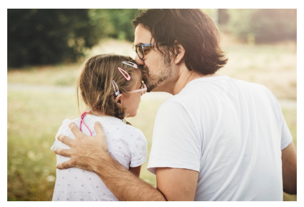
Focus on Relationship

"I have seen many Adventists trying to earn their Salvation through their own works and merits. They have to have love, joy, peace, long-suffering, ... and kindness and self-control, and when they have all these fruits of the spirit than they will have Salvation. ... But we are not perfect.