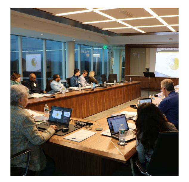
How can our K-12 schools, and especially academies, maintain their quality and continue to grow as well? One vital aspect is finances—and

Adventist churches, at times, have been exclusive and repellent. We have cared more about being right than about being kind. We have confused acceptance with agreement. ... Now is the time to be more intentional concerning the openness and warmth of our local church climates. <u>CLICK HERE</u> to learn about a new website created to help churches craft their own welcoming statement.