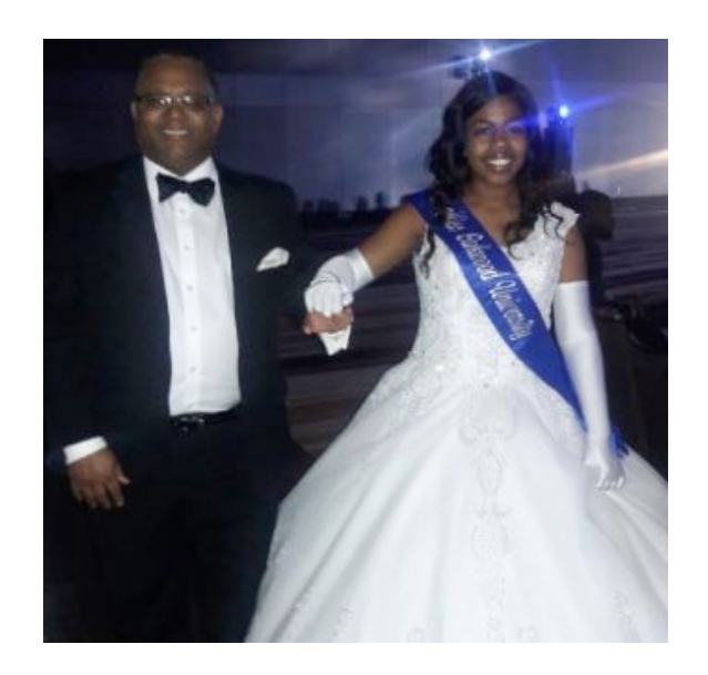
On Feb. 7, the Oakwood University Pre-Alumni Council members headed to Atlanta, Ga., for the UNCF Leadership Conference. The fourday conference marks the 72nd annual meeting of UNCF's National Alumni Council, and the 60th National Pre-Alumni Council. MORE