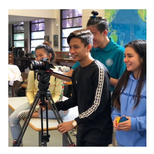
Sonscreen Film Festival and Southern Adventist University School of Visual Art and Design recently partnered to present a film production workshop at Hawaii Mission Academy. MORE