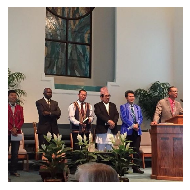
On Jan. 18, more than 170 refugees from six language groups braved the winter conditions to gather at the Greensboro Seventh-day Adventist Church for what they called a "Refugee Families Thanksgiving Worship." MORE